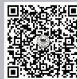
Cumulative Update List

The Update Corner shows selected items from the unillustrated cumulative catalog update list.